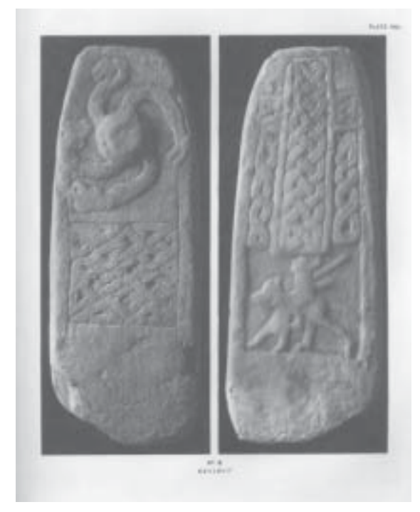
Plate VIII, the so-called 'Sun Stone'. The overall tone here indicates the extent of the copper plate not the page size. (The plates are a uniform size: 226 x 175mm, on trimmed page size 277 x 217mm)

The letterpress printing, finishing and binding was done by James MacLehose and Sons, a Glasgow firm particularly well known for fine bindings. The demy quarto book has front and back bevelled boards, in greenish-tan cloth, centrally stamped with a gilt device of the arms of Stirling Maxwell within a holly wreath; the spine bears an abbreviated title, SCVLPTVRED STONES AT GOVAN, in gilt Roman capitals, with 'GLASGOW 1899' at the tail.