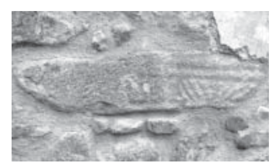
The carved stone in the east gable

Two hitherto unrecorded carved stones were found below the ivy. When the church was in use they were probably also unseen, concealed below plaster or harling. They have been left in situ, but are fairly easy to see. The first is set in the inner east gable, and may be part of another small cross-slab, though it is perhaps too incomplete to be certain of its exact character. The second is set in the exterior south wall, above a blocked medieval window. It seems to show two parallel lines ending in a lightly