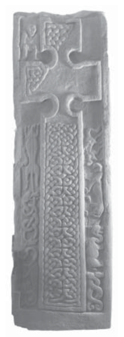
The Drosten Stone

It has one of a small but now growing number of Roman-letter inscriptions from this period which are being found in Scotland. The inscription is placed low on the cross, possibly for use in prayer.