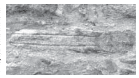
The carved stone in the south wall

incised leaf- or spearhead-shaped element. The 'leaf' has a mason's mark rather like an elaborate 'W' incised on it, and there is a tiny cross incised on the 'shaft'. Two rather enigmatic finds, though at this site it would certainly be tempting to associate them with the early medieval collection.