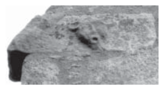
The grotesque head

An unusual feature is a small grotesque head place on the side, rather than the end (as would be more usual), of the lowest stone of the northwest gable-coping.