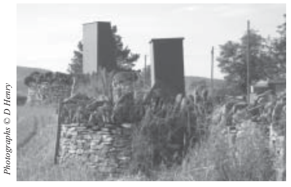
Boxes in the landscape. A view from the site of Aberlemno 1