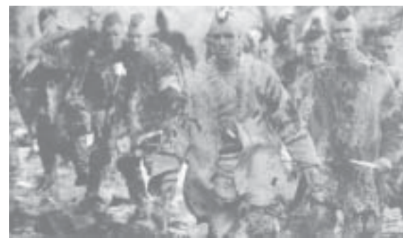
The 'Seal People' of Wester Ross (Sealink – could the invention of this tribe possibly have been inspired by the writings of E Peterson?)

The screams of a red-tailed hawk are used [on the film's soundtrack] in place of eagle sounds. Red-tailed hawks do not live in Europe.