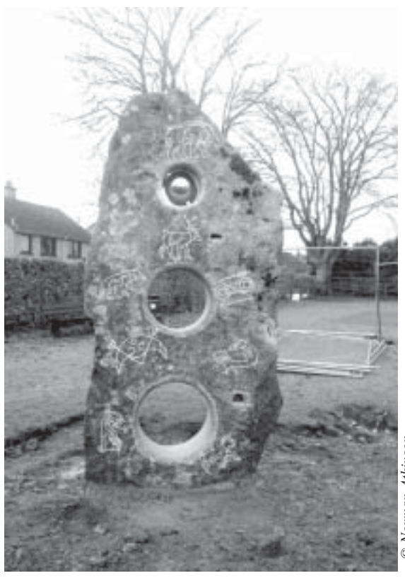
The 'new' Pictish symbol stone in Letham playpark

Letham Park in Angus (renowned as the campsite for the 'Electric Temple' in the early days of the Dunnichen Festival), has a play area which has recently been undergoing a makeover. One of the new pieces of equipment erected there is a monolith perforated with three large holes and decorated with Pictish symbols – eight on each of its main faces – a dizzying, haphazard array.