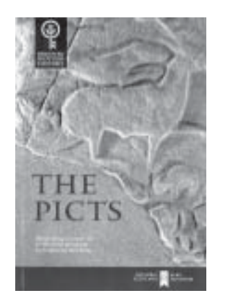
The Picts: including guides to St Vigeans Museum and Meigle Museum