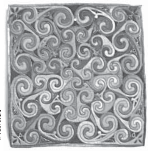
Shandwick panel (55 x 55cm), hand painted silk with machine quilting

Each venue displaying a selection from the main exhibition (normal opening times).