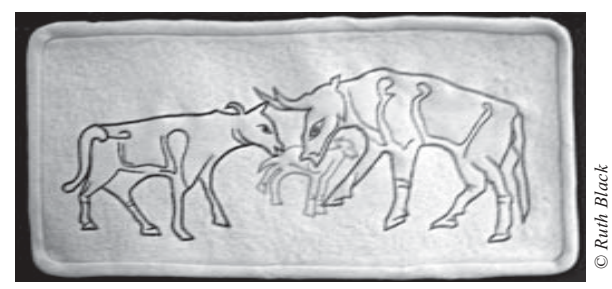
Tarbat calf (48 x 22cm), Harris Tweed embrodiered with metal threads